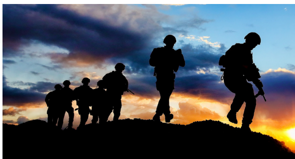
Australian soldiers with the 7th Battalion, The Royal Australian Regiment, assigned to the U.S. Army 2nd Cavalry Regiment Task Force, patrol at Multinational Base Tirin Kot, Uruzgan province, Afghanistan, Nov. 6, 2013. (DoD photo by Cpl. Mark Doran, Australian Defense Force/Released)(CJTF-OIR) Aug. 20, 2015.

The strategy defines an operational end-state , and associates it with the ways to accomplish the end-state, and the means necessary to support the ways . This ends, ways, means framework is described in greater detail later in the document.