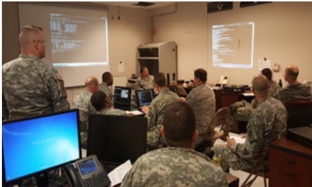
Airmen and Soldiers train for Cyber Guard 15, conducting a "red vs. blue" cyber exercise.

Mid-term efforts (looking 18-36 months ahead) will focus on synchronization of efforts and effects. New concepts and policies will improve agility and responsiveness, clarification of authorities will streamline and better focus operations in the IE, and enduring partnerships across the USG will facilitate effective DoD operations in the IE.