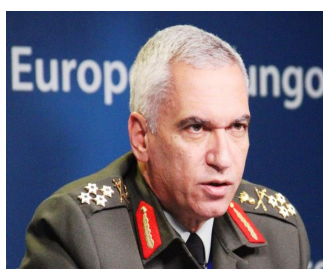
Gen. Mikhail Kostarakos

The views expressed in this newsletter are those of the author and do not represent the official position of the European Union Military Committee or the single Member States' Chiefs of Defence.