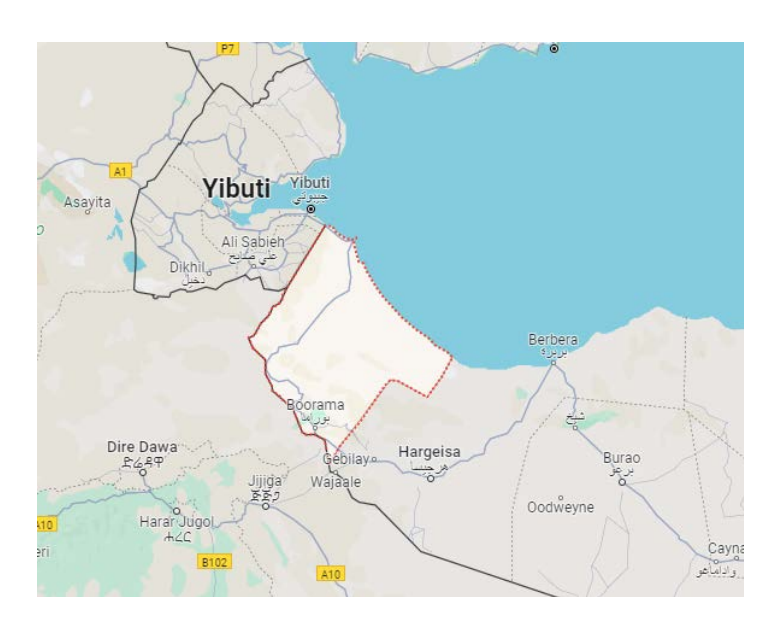
Figure 3. Location of Awdal, region outlined in red.

If this is true, it would explain, albeit perhaps only in part, why Abiy seems to find the outlet to the sea that it has long been using at a high price from Djibouti insufficient or unacceptable. Djibouti charges Ethiopia more than a billion US dollars a year in port fees, a huge sum for a country under economic sanctions and where almost a fifth of its population is dependent on food aid <sup>19</sup>. The possible purchase of a port from Somaliland would improve these conditions.