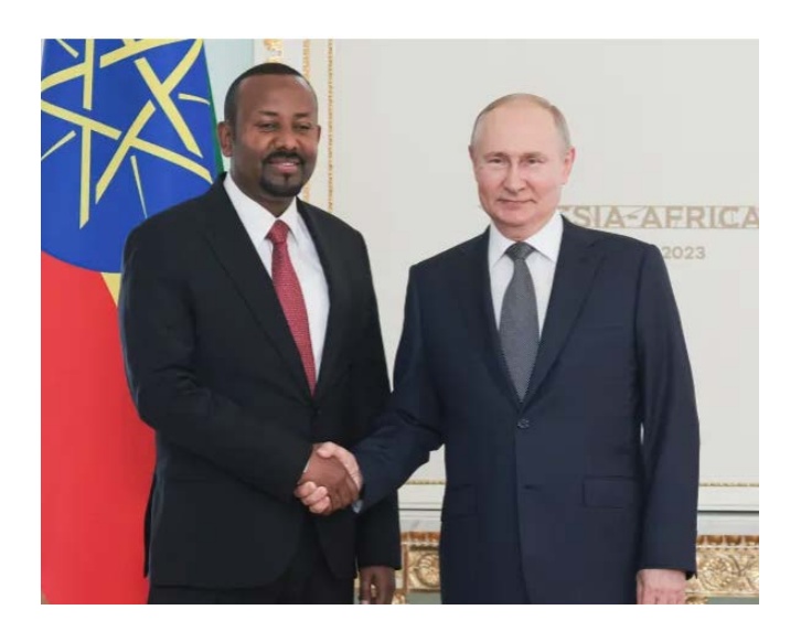
Figure 4. Abiy and Putin. Russia-Africa Summit, July 2023.

It is conceivable that Russia, which has not made a statement on the issue, could support Ethiopia in this conflict. The relationship between the two countries is good, as it is with the Houthis, and the tension in the Red Sea is deeply damaging to Western countries.