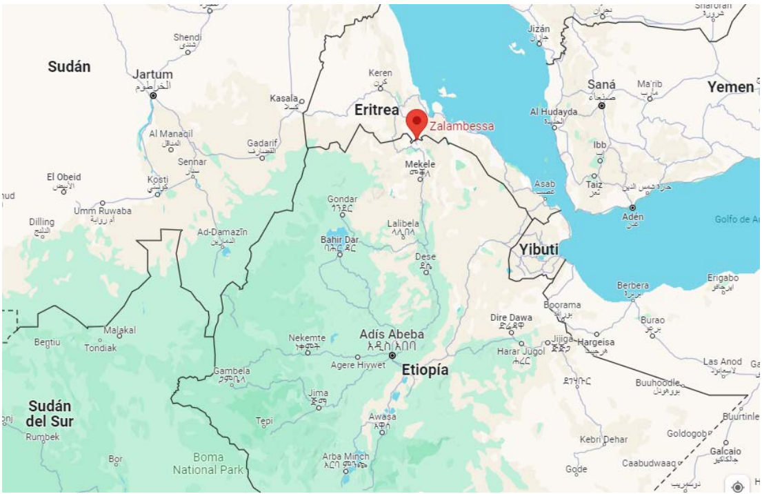
Figure 1. Map of the location of Zalambessa.

The escalation of tension is not confined to the level of rhetoric; there appear to be indications that Ethiopia is massing troops in Zalambessa, near the Eritrean border and the port of Assab. It is also possible that Eritrean President Afwerki is supporting the Amhara<sup>10</sup>.