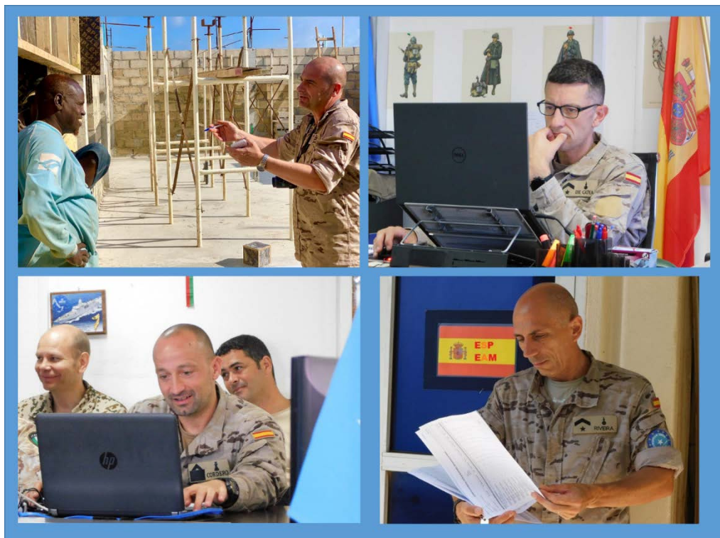
Figure 2. EUTM Somalia Headquarters and Command Support Team.

To this end, EUTM maintains its three-pillar approach: advising the Ministry of Defence and the Headquarters of the Armed Forces on the reform of the Security and Defence Sector (SSR); contributing to the development of an autonomous military training system, with the training of Somali units and instructors – more than 6,000 Somali army personnel have already been trained by European military personnel – in addition to the development of a military training programme; and providing mentoring and advisory services to the Mogadishu training camp to make it a centre of excellence for Somali military training.