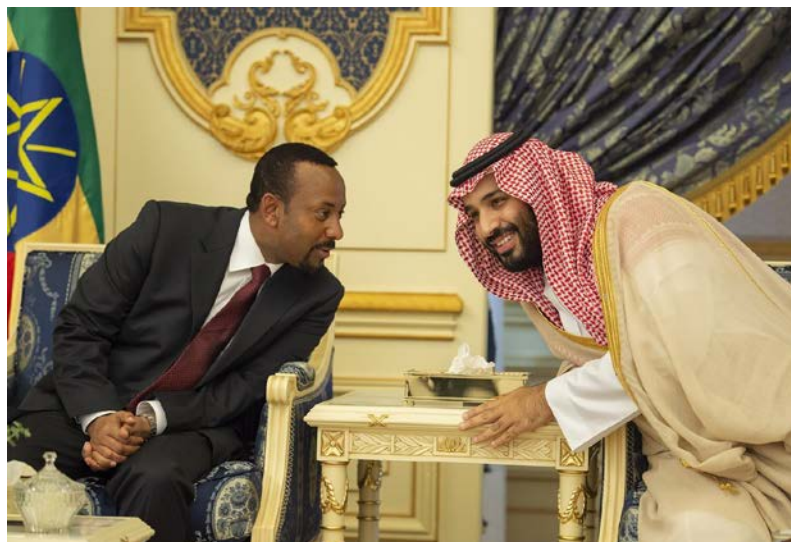
Photo 4. Saudi Prince Mohammed bin Salman and Ethiopian Prime Minister Abiy Ahmed during the signing of the Eritrea-Ethiopia peace agreement in 2018.

Riyadh sees a nexus between Yemen and the Horn of Africa. Since the military intervention in the country began in March 2015, the region has been considered an area of strategic influence for operating in this conflict. As a result, Saudi Arabia pressured the various governments of the Horn of Africa to forge an alliance and make progress against the Houthi militia in Yemen. Sudan, Eritrea and Somalia then joined the Saudi-led military axis. Such military cooperation with African countries is often reinforced by economic incentives. Thus, Saudi Arabia deposited $1 billion in Sudan's central bank shortly after Sudan contributed more than a thousand soldiers to the fighting in Yemen in 2015. 22 The priority of the Saudi's regional policy is the resolution of the conflict in Yemen, which has become an economic and security disaster for Riyadh in recent years. Recent direct talks with Iran show Saudi Arabia's political will to overcome this conflict diplomatically, as a military solution has become unlikely.