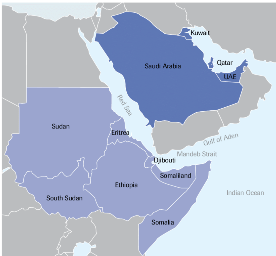
Photo 1. Map of the Horn of Africa and the Arabian Peninsula.

Over the past fifteen years, the countries of the Gulf Cooperation Council – primarily Saudi Arabia, the United Arab Emirates (UAE) and Qatar – have strengthened economic and security ties across the Red Sea, enhancing their economic and diplomatic role in sub-Saharan African countries where they now have a major presence. Emiratis, Saudis and Qataris work in the region with the aim of building their status as an international power by acting as major brokers in the continent's affairs and conflicts.