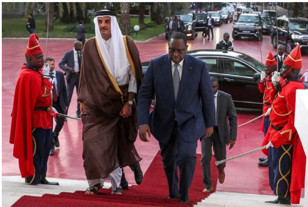
Photo 5. The Emir of Qatar and Senegal's President Macky Sall during the Qatari leader's tour of West Africa.

Relations between Qatar and sub-Saharan African countries, with the exception of Sudan and Eritrea, are still new and under construction. Although ties with the Maghreb countries date back to the 1970s, it was only in the 21 st century that the country began forging closer diplomatic relations south of the desert. Currently, some 20 sub-Saharan countries have embassies in Doha. In addition to Sudan and Eritrea, two states are of particular interest to Qatar, the two largest economies in the region: South Africa and Nigeria. In the first case, Qatar Petroleum and the South African company Sasol joined forces to build a gas-to-liquids plant in Ras Laffan (Qatar's main gas hub). This interest in South African technology has substantially increased bilateral relations and helped to dispel the usual stereotypes of a technologically backward continent. In the case of Nigeria, relations with Qatar are, to some extent, much older, as both countries are members of OPEC. However, it was not until 2013 that Nigeria opened a diplomatic mission in Qatar. Although the economic reasons for this presence in Qatar were important, Nigeria was not looking to buy gas and had no liquidity problems. The main reason was political in