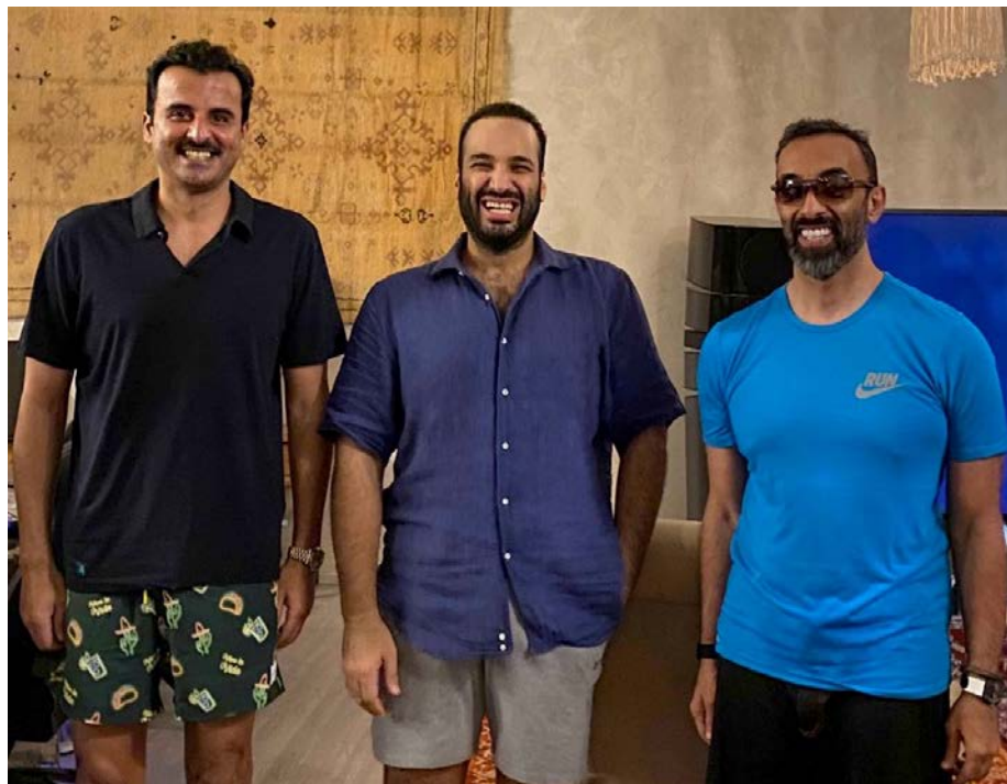
Photo 6. Qatar's Emir Al Thani, Saudi Prince Mohammed bin Salman and UAE National Security Chief Tahnoun Bin Zayed Al Nahyan (son of the UAE's founder and first president) at a meeting on the Red Sea in September 2021, a few months after the restoration of diplomatic relations between the Gulf monarchies.

During the four years of the blockade, the Emiratis viewed the absence of support for their position or the choice of neutrality as African leaders siding with the Qatari position and more personally as an expression of ingratitude towards their Emirati patrons. In Somalia, the rivalry between Qatar and the UAE had a detrimental effect on relations between Mogadishu and the autonomous regions of Somaliland and Puntland. Thus, the UAE's growing economic and military presence in these regions further contributed to the internal fracture among Somali political forces. 38 In any case, the rapprochement between Qatar, Saudi Arabia and the UAE in January 2021, which brought an end to the blockade and a return of diplomatic relations, has meant that African countries can now improve their relations with both sides.