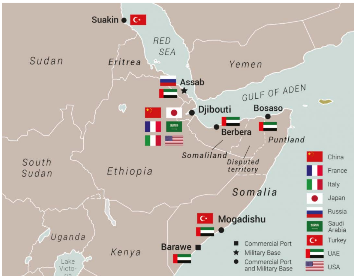
Photo 3. Ports and military bases in the Horn of Africa.

(Mozambique) and Luanda (Angola). 15 In Djibouti, the Emirati operator also managed the port of Doraleh until the local government terminated the contract in 2018. DP has also won a concession for the construction of a logistics centre in Kigali (Rwanda) and its subsidiary P&O Ports has been awarded the contract for the development of the port of Bosaso, in the Somali autonomous region of Puntland. In addition, new port projects in Port Sudan and Madagascar are being negotiated with the local authorities. 16 Abu Dhabi Ports manages the port of Kamsar in Guinea. 17 The UAE has established itself as an influential maritime player and its efforts to build a global network of port infrastructures not only favour its competitiveness as a commercial maritime power, but also strengthen its military capabilities.