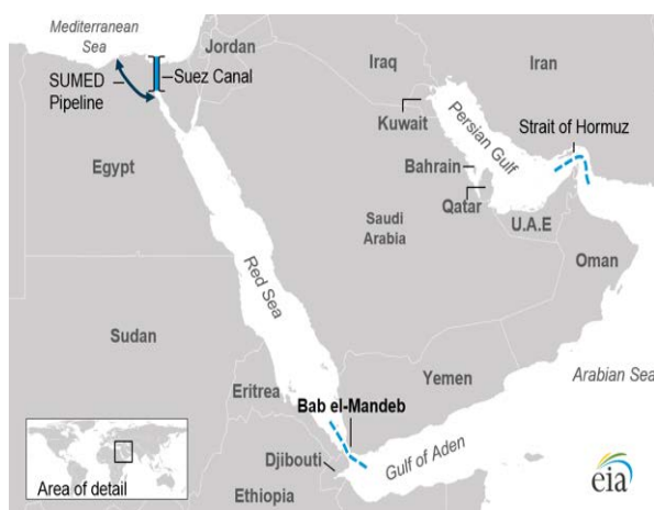
Figure 1. Bab el-Mandeb Strait as a strategic point for maritime transit.