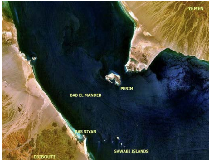
Figure 3. Perim Island in the coast of Yemen.

Administratively, the African shore of Bab el-Mandeb belongs to the small nation of Djibouti and Eritrea while the Arabian shore belongs to Yemen 7 . The enclave is separated at the same time by two channels of navigation through the Yemeni Island of Perim. The small nation of Djibouti has always acknowledged the advantages of its strategical position, not only as one of the southern gateways to the Red Sea but also as a relatively stable home for military bases in the horn of Africa. As it is geographically limited by size and natural resources, its source of economic prosperity comes from its port services as the southern gate to the Red Sea 8 . Its trading partners are the neighbouring Ethiopia and Somalia and relies highly on the international aid and investments in its country 9 . This African country is gaining relatively stability according to World Bank Governance indicators, progressively increasing since 2017 in Political Stability and Absence of Violence/terrorism estimations 10 . Having had only two Presidents since its independence