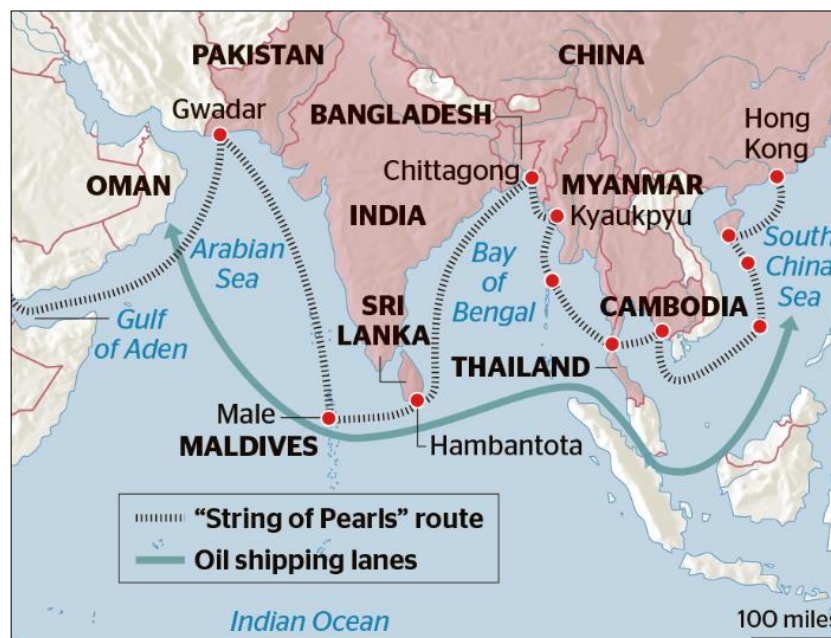
Figure 1. The String of Pearls and key SLOC in the IOR.

Although the Indian Ocean falls under the “natural” sphere of influence of India, the latter's role has been largely overshadowed by China's String of Pearls. In 2013, President Xi Jinping announced China's strategy called the “Belt and Road Initiative” (BRI) or “One Belt, One Road” (OBOR). This strategy consists of a route by land and sea. The latter is known as the Maritime Silk Road, the sea route of the historical Silk Road that the BRI intends to emulate. The String of Pearls refers to the alleged attempt of China to contain and encircle India, while gaining control over the key SLOC of the IOR, as shown in Figure 1. This paper intends to analyze India's response to the Chinese strategy, as well as the future outlook of Modi's foreign policy in the Indian Ocean.