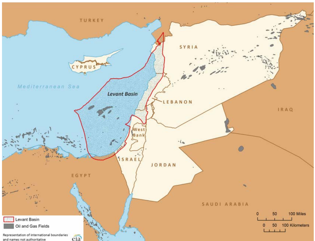
Figure 2: Oil and natural gas fields in the East Mediterranean region.